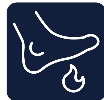
Warming up the soles