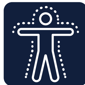
Partial Intensity Control