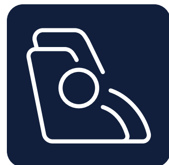
Moving the Left and Right Sides Separately