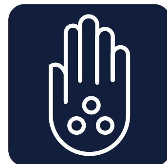
Magnetic Acupressure for Hands