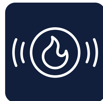
Heat Applied Massage