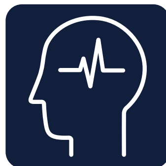
Brain Massage with Binaural Beat