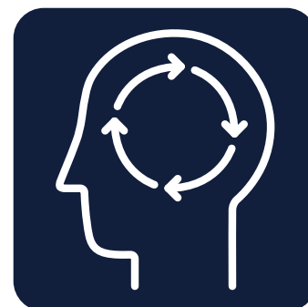
Voice Guided Meditation Massage