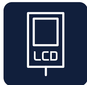
4" Intuitive Remote Control