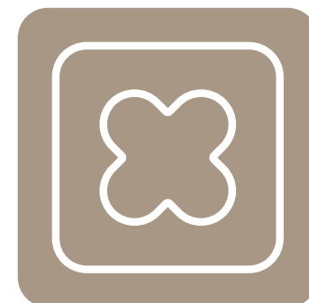
NAVER CLOVA Collaborated AI Speaker