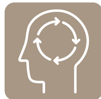
Voice Guided Meditation Massage