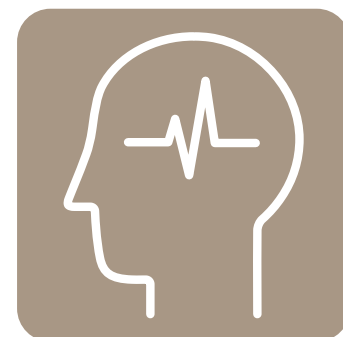
Brain Massage with Binaural Beat